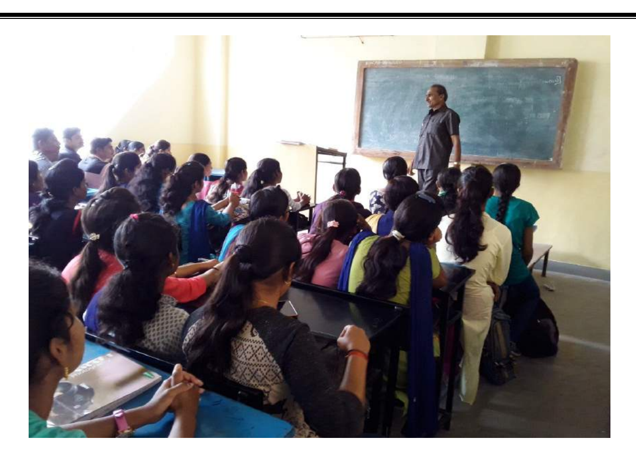
EYE Checkup Camp by Commerce Department