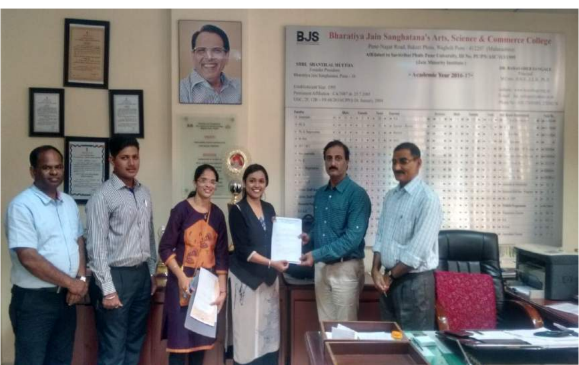
Exchange of MOU (Tally ERP9) with CCA