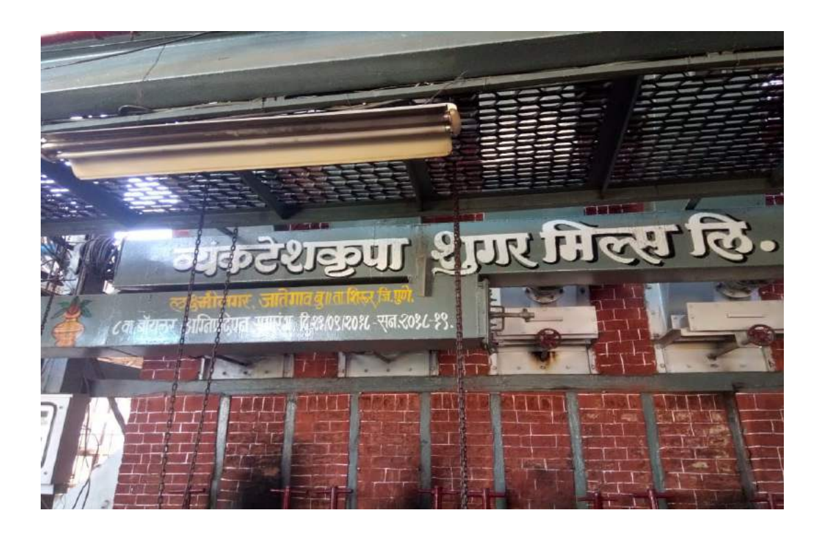
Visit to Sugar mill by M.Com students