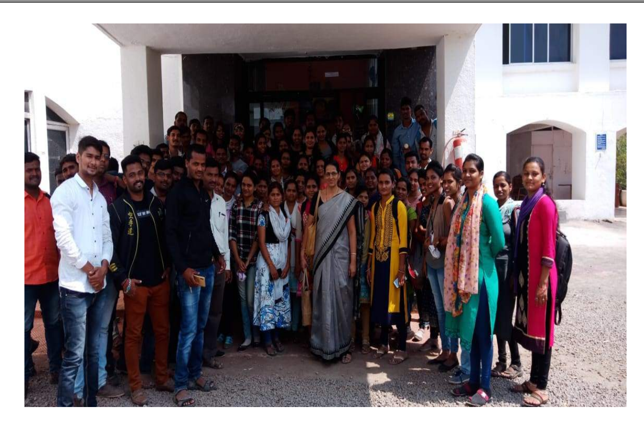
STUDY VISIT TO PHOENIX MALL