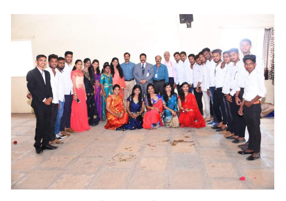
Farewell party of T.Y.B.Com